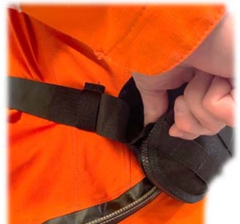
Stow straps in pockets