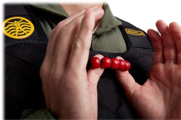
Pull sharply with both hands to inflate