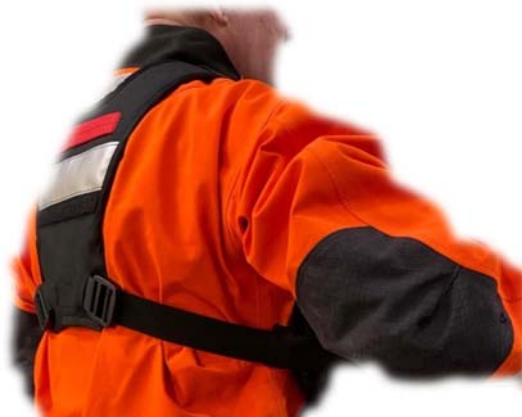
Adjust back straps on each side